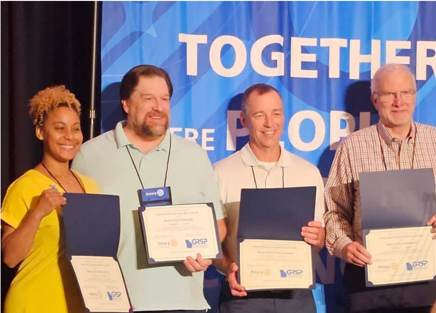
Posted by Katheryne Fields April 29, 2026