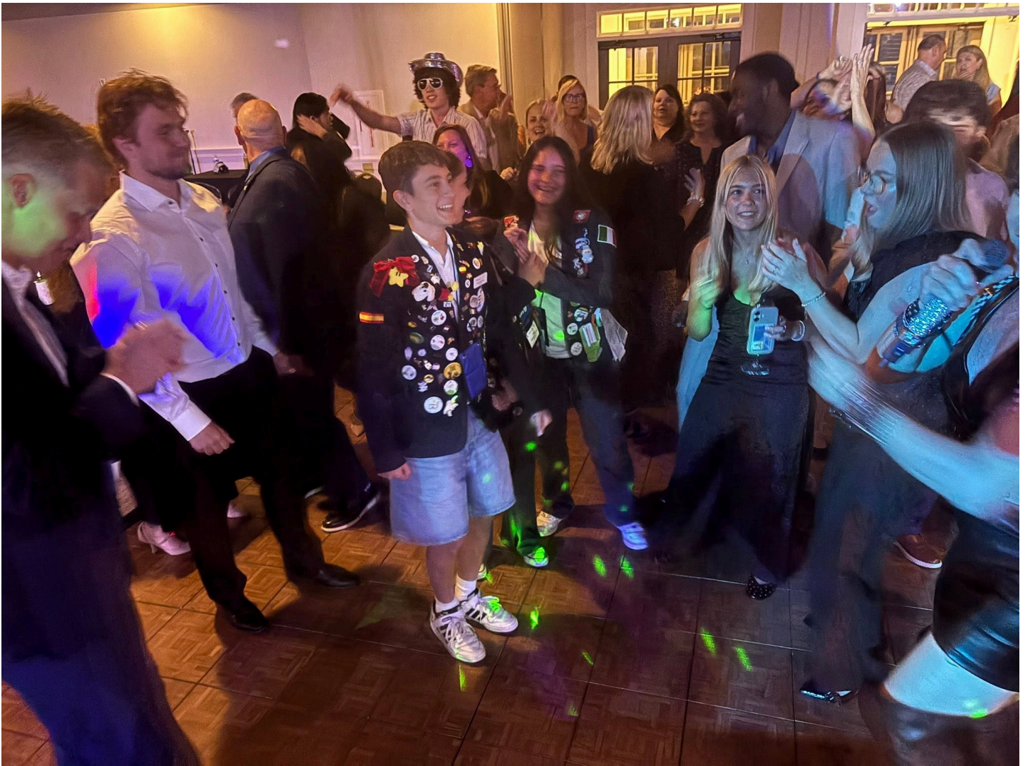
Posted by Steve Ivory April 29, 2026