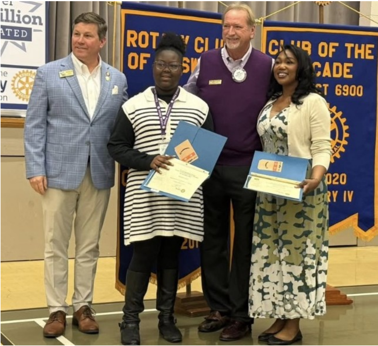
Posted by Becky Nelson April 29, 2026