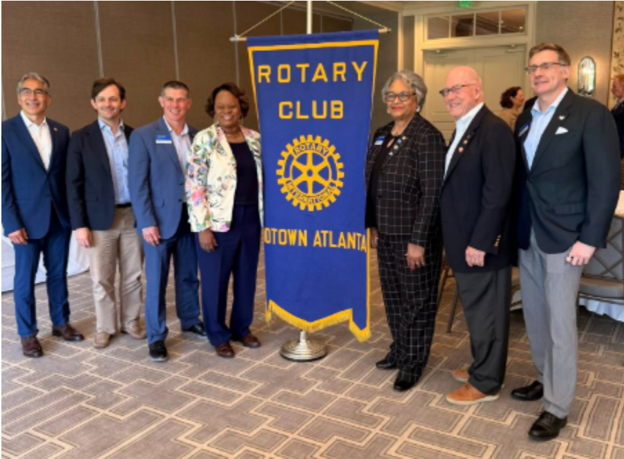
Midtown Atlanta RC celebrates 70 years of service