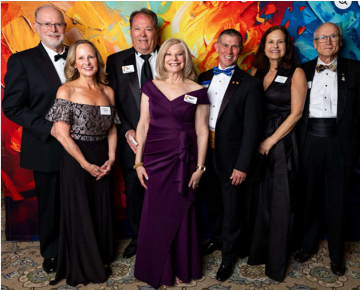
Buckhead's Annual Fundraiser