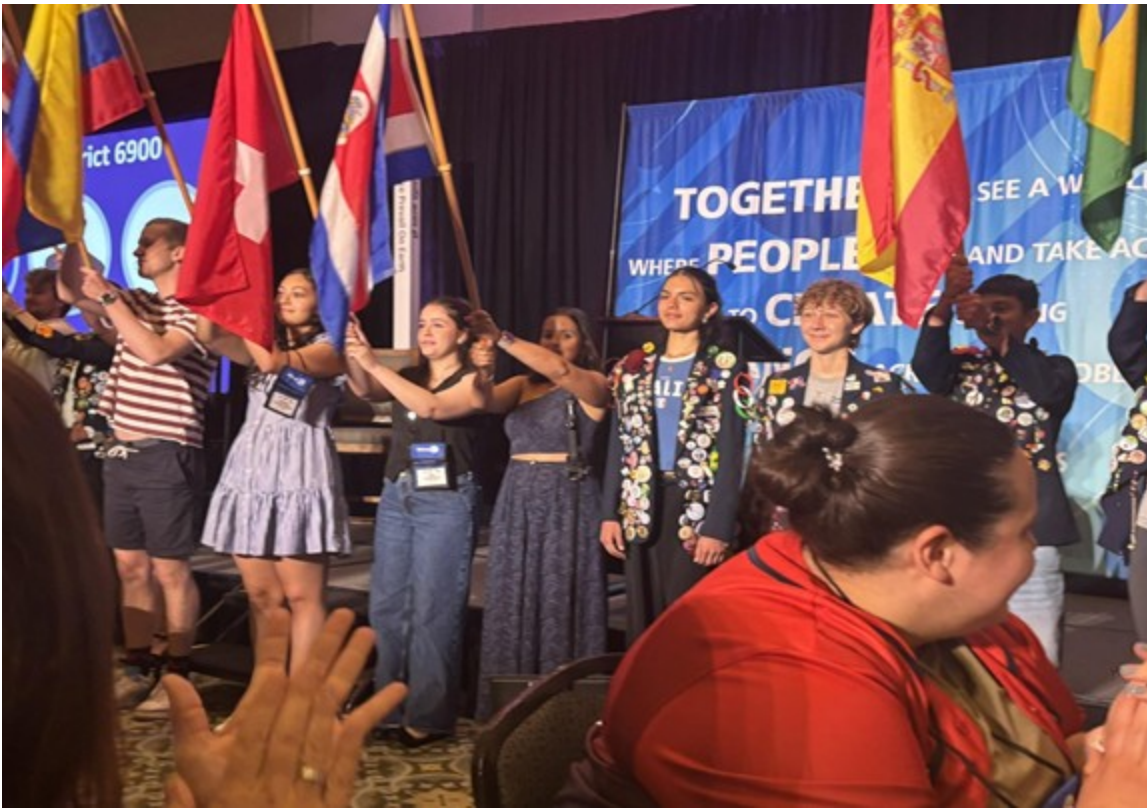
GRSP carries on tradition of presenting their flags

This May, as Rotary celebrates Youth Service Month , District 6900 proudly shines a light on the students, young professionals, and emerging leaders whose lives are being shaped through Rotary. From Interact and Rotaract to GRSP, RYLA, Laws of Life, scholarships, and mentoring, we are not just serving youth — we are investing in the future of our communities and our world. The photos are from District Conference, where many of you saw an amazing show on Saturday morning showcasing our GRSP, RYE, Laws of Life, RYLA programs. GRSP students acted as golf cart drivers and many great interactions occurred. Remember that RYLA starts June 6 so please sign up your students - there's an article later in this newsletter about this.