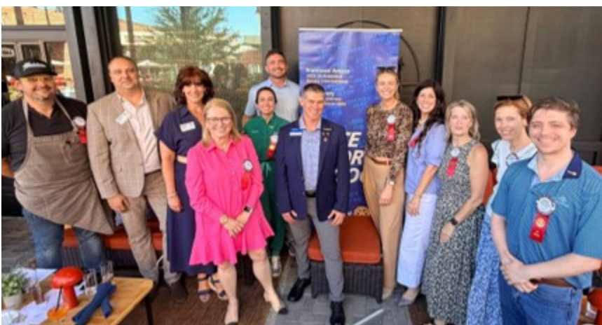
Trilith Companion Club