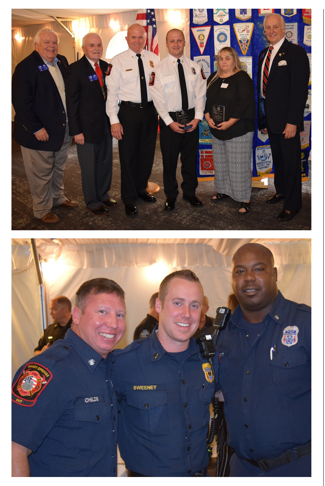
SANDY SPRINGS ROTARY SOCIAL EVENT ON MONDAY, OCTOBER 30TH AT BROOKLYN CAFE BEGINS AROUND 5:30 P.M.