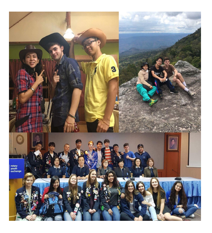
Rotary Club of Dunwoody Happy Hour