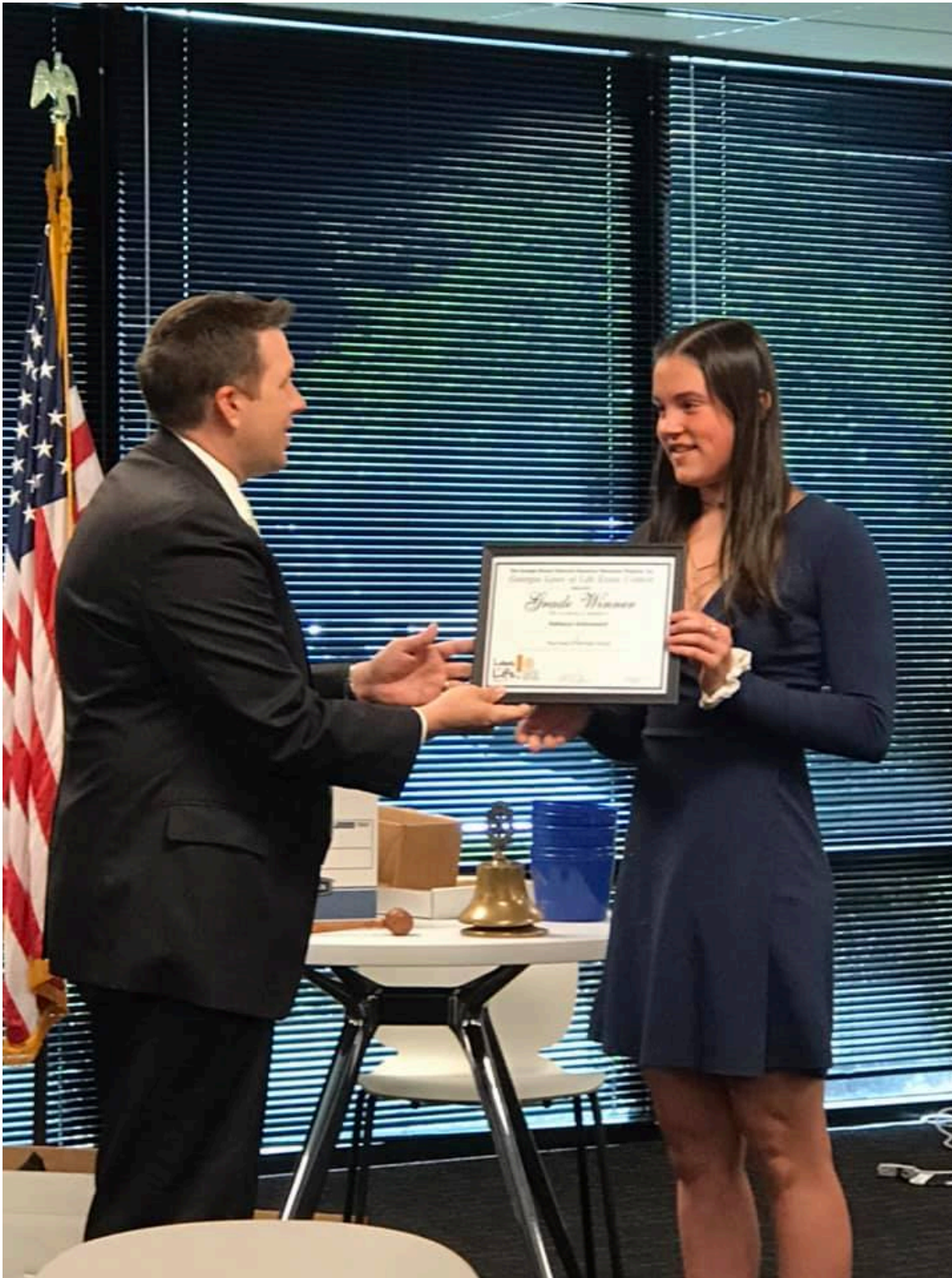
At Paul Duke STEM High School in Gwinnett County, participation in the Georgia Rotary Clubs sponsored Laws of Life Essay Contest soared from 12 students last year to 718 students for the 2019-2020 contest.