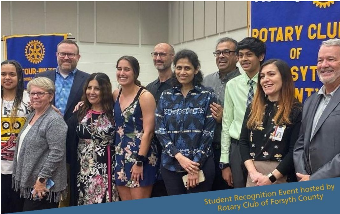
Student Recognition Event hosted by Rotary Club of Forsyth County