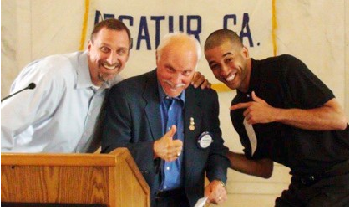
Boys and Girls Club grant recipients with Decatur Rotary's Community Grants Chair

More than 60 District 6900 Rotarians and family members attended this year's Rotary International Convention in Toronto, Canada. We were treated to amazing entertainment and speaker's - including Former First Lady Laura Bush and many more. [more]