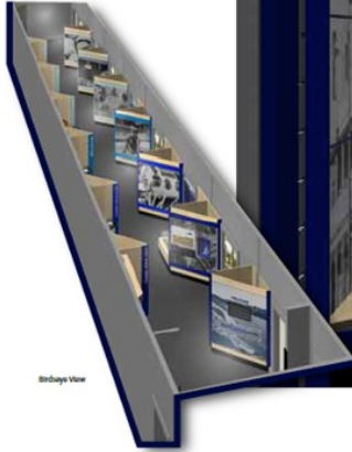
Birds Eye View