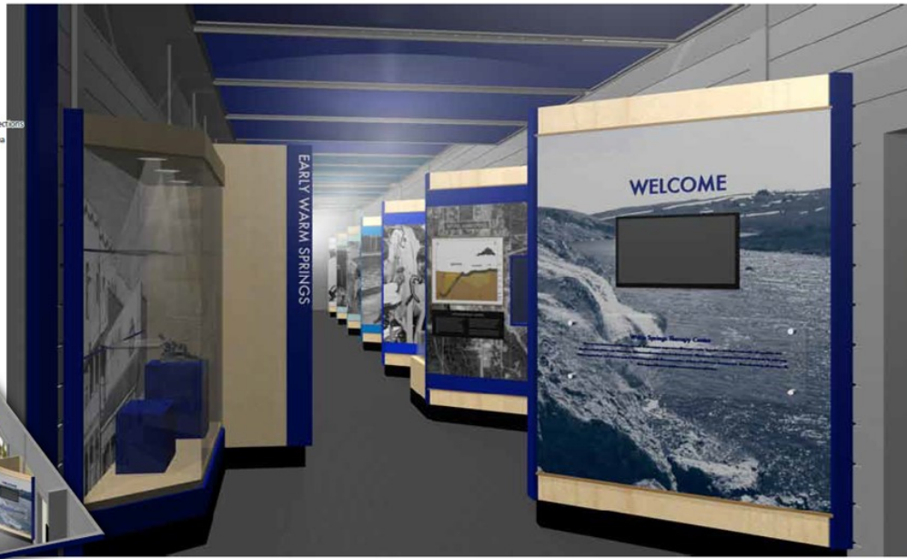
Entrance View Looking Down Main Aisle