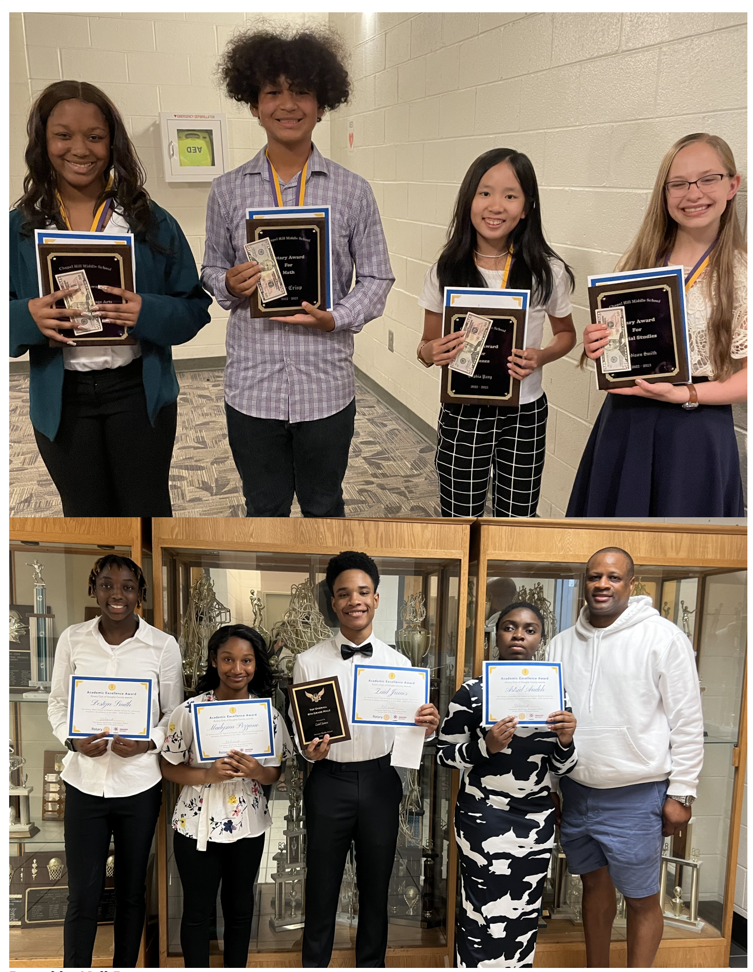
Posted by Nell Boggs