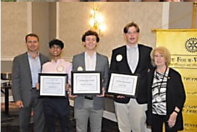
Posted by Sally Platt August 22, 2023