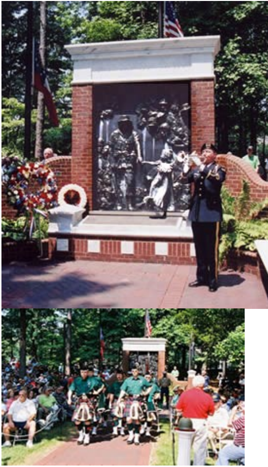
Posted by Lynne Lindsay