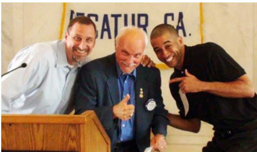
Boys and Girls Club grant recipients with Decatur Rotary's Community Grants Chair

In May, the Decatur Rotary Club presented $18,000 in grants to non-profit organizations based in DeKalb County that focus on youth literacy and at-risk youth in DeKalb County. The 2018 recipients included: